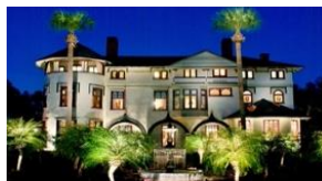
The Stetson Mansion